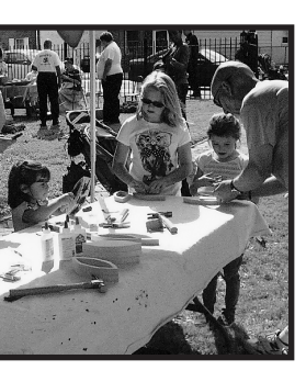
A tour of the open houses and a stop for tea afterwards with views of the Delaware River.

Ye Old Bakery (left) and the Children's Corner (below) are always popular spots.