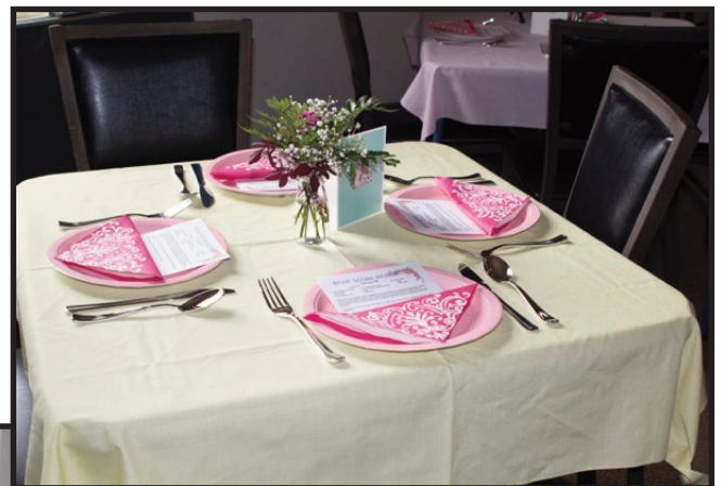
Above: One table is set for the Tea. 60 people attended the Tea.