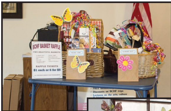
Above: Basket Raffle at the Tea.