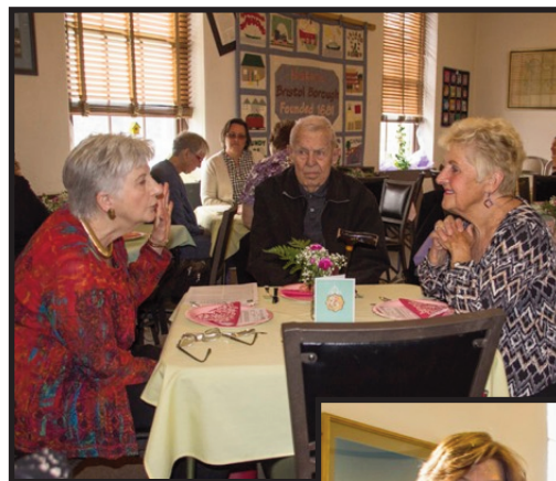
Left: Ladies and a gentleman anticipate the tea.