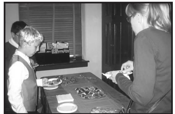
Above and Left: At the conclusion of the "Living Wax Museum," the cast and the audience enjoyed lemonade and pastries prepared by members of BCHF's Ways & Means Committee.