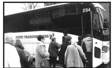
Boarding the bus following lunch at the JNA Inst. of Culinary of Arts Restaurant.