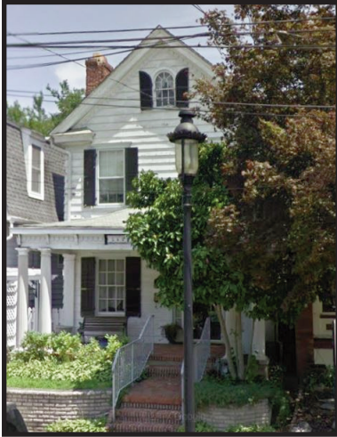
Kalinowski Residence & Gardens, 205 Jefferson

The following private homes will be open for touring from 10:00 a.m. to 4:00 p.m. Free shuttle buses will transport visitors to the homes and the tea throughout the day.