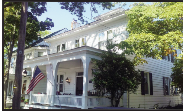
Mulhern-Riley Residence, 715 Radcliffe Street