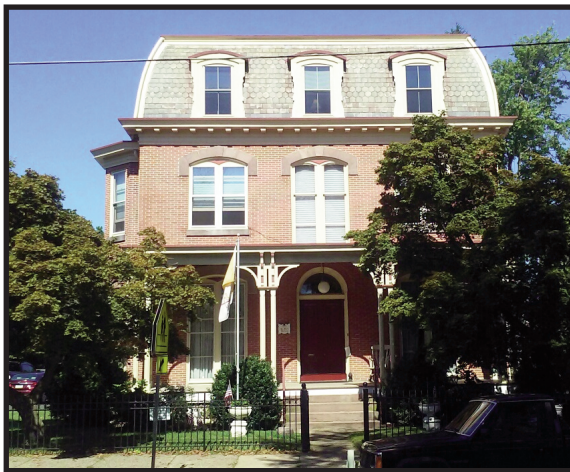
St. Mark Rectory, 1025 Radcliffe Street