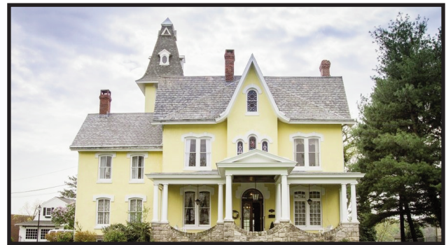
Wade Funeral Home & Residence, 1002 Radcliffe Street

There's something for everyone at HBD. Whether you are a car enthusiast or a kid or a kid at heart, have an interest in military times of the past, enjoy artwork, or listening to music. You'll find it all at Historic Bristol Day. Come stroll the historic streets and have a great day in Beautiful Bristol Borough. Here's just some of the entertainment and events planned for the day: