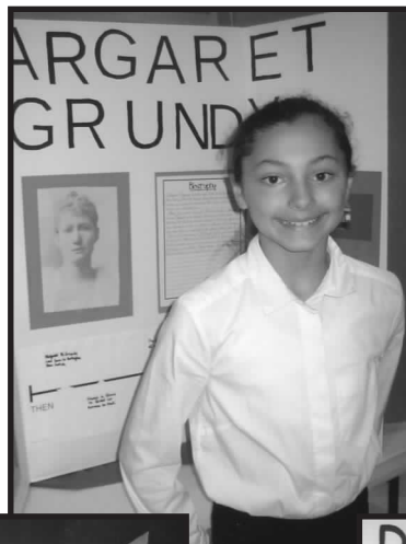
Children from the Snyder-Girotti School portraying famous Bristolians on Historic Bristol Day 2017

Light refreshment will be served. In lieu of an admission fee, donations for the Snyder-Girotti Elementary School's Gifted/Enrichment Program are requested. Everyone's invited!