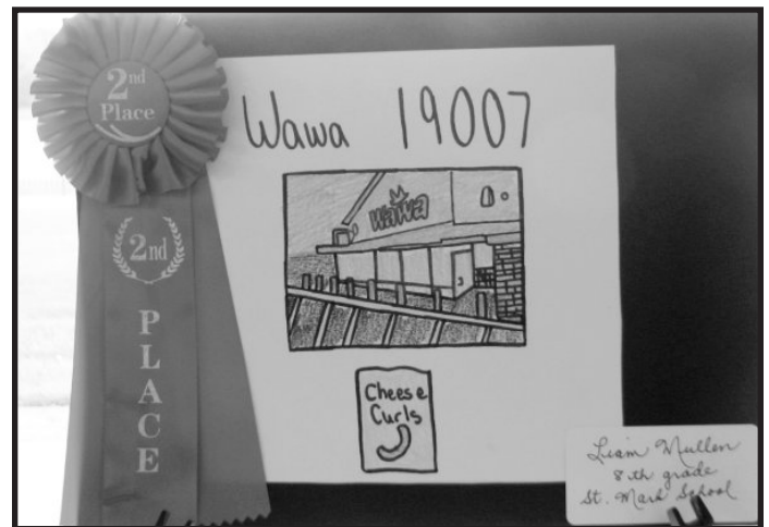
Below: 2nd Place - Liam Mullen