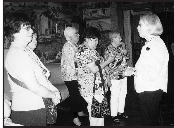
June 20th - Bus trip to Winterthur, featuring "the costumes of Downton Abbey" Exhibit & Museum Tour