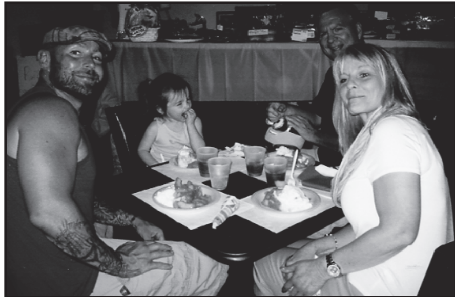
Guests enjoy the peach treat and sociability of the afternoon