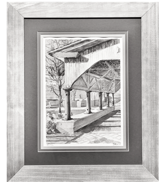
The Sagolla watercolor featuring the wharf